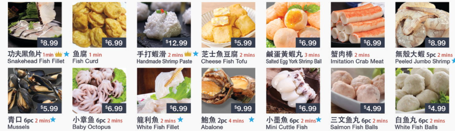
功夫黑魚片 1 min $8.99 魚腐 1 min $6.99 手打蝦滑 2 mins $12.99 芝士魚豆腐 2 mins $5.99 鹹蛋黃蝦丸 3 mins $6.99 蟹肉棒 2 mins $6.99 無殼大蝦 5pc 2 mins $8.99 Snakehead Fish Fillet Fish Curd Handmade Shrimp Paste Cheese Fish Tofu Salted Egg York Shrimp Ball Imitation Crab Meat Peeled Jumbo Shrimp 青口 6pc 2 mins $5.99 小章魚 6pc 2 mins $6.99 龍利魚 2 mins $6.99 鮑魚 2pc 4 mins $9.99 小墨魚 6pc 2 mins $6.99 三文魚丸 6pc 2 mins $4.99 白魚丸 6pc 2 mins $4.99 Mussels Baby Octopus White Fish Fillet Abalone Mini Cuttle Fish Salmon Fish Balls White Fish Balls