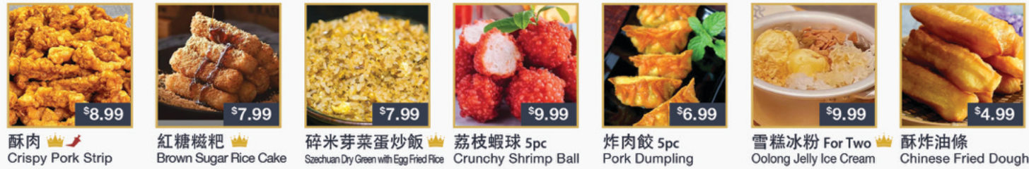
酥肉 $8.99 紅糖糍粑 $7.99 碎米芽菜蛋炒飯 $7.99 荔枝蝦球 5pc $9.99 炸肉餃 5pc $6.99 雪糕冰粉 For Two $9.99 酥炸油條 $4.99 Crispy Pork Strip Brown Sugar Rice Cake Szechuan Dry Green with Egg Fried Rice Crunchy Shrimp Ball Pork Dumpling Oolong Jelly Ice Cream Chinese Fried Dough