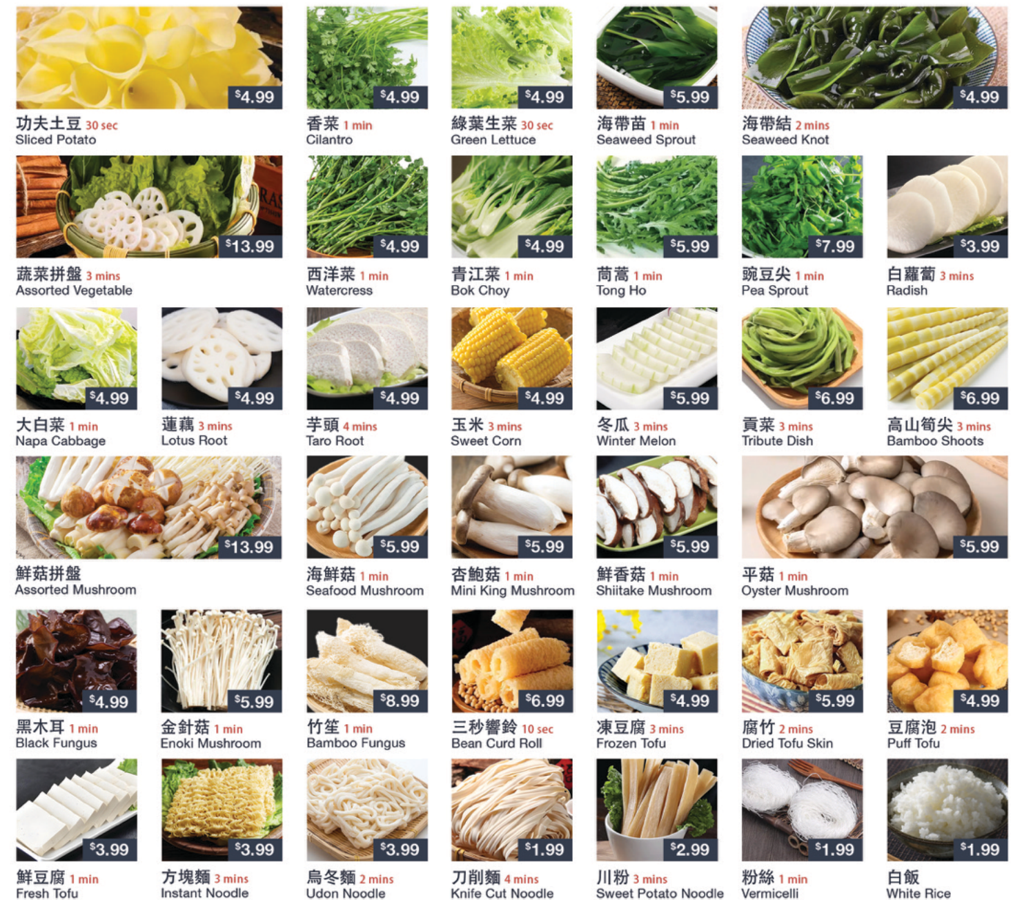
功夫土豆 30 sec $4.99 香菜 1 min $4.99 綠葉生菜 30 sec $4.99 海帶苗 1 min $5.99 海帶結 2 mins $4.99 Sliced Potato Cilantro Green Lettuce Seaweed Sprout Seaweed Knot 蔬菜拼盤 3 mins $13.99 西洋菜 1 min $4.99 青菜 1 min $4.99 茼蒿 1 min $5.99 豌豆尖 1 min $7.99 白蘿蔔 3 mins $3.99 Assorted Vegetable Watercress Bok Choy Tong Ho Pea Sprout Radish 大白菜 1 min $4.99 蓮藕 3 mins $4.99 芋頭 4 mins $4.99 玉米 3 mins $4.99 貢菜 3 mins $6.99 高山筍尖 3 mins $6.99 Napa Cabbage Lotus Root Taro Root Sweet Corn Tribute Dish Bamboo Shoots 鮮菇拼盤 $13.99 海鮮菇 1 min $5.99 杏鮑菇 1 min $5.99 鮮香菇 1 min $5.99 平菇 1 min $5.99 Assorted Mushroom Seafood Mushroom Mini King Mushroom Shiitake Mushroom Oyster Mushroom 黑木耳 1 min $4.99 金針菇 1 min $5.99 竹筍 1 min $8.99 三秒響鈴 10 sec $6.99 凍豆腐 3 mins $4.99 腐竹 2 mins $5.99 豆腐泡 2 mins $4.99 Black Fungus Enoki Mushroom Bamboo Fungus Bean Curd Roll Frozen Tofu Dried Tofu Skin Puff Tofu 鮮豆腐 1 min $3.99 方塊麵 3 mins $3.99 烏冬麵 2 mins $3.99 刀削麵 4 mins $1.99 川粉 3 mins $2.99 粉絲 1 min $1.99 白飯 $1.99 Fresh Tofu Instant Noodle Udon Noodle Knife Cut Noodle Sweet Potato Noodle Vermicelli White Rice