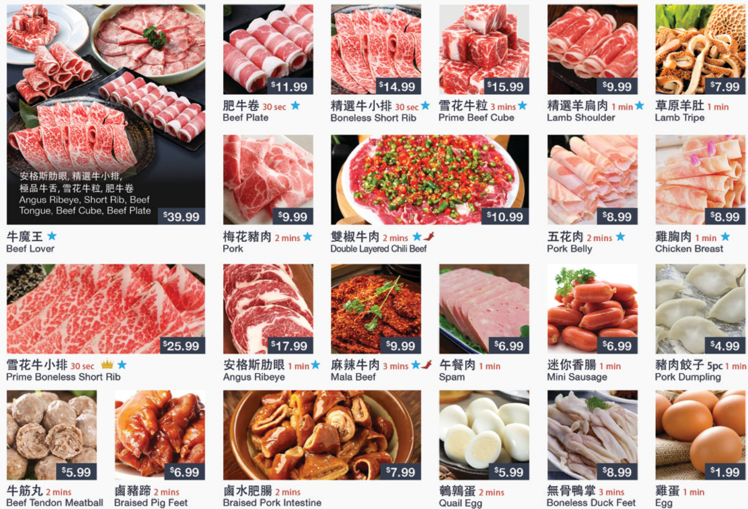
安格斯肋眼, 精選牛小排, 極品牛舌, 雪花牛粒, 肥牛卷 Angus Ribeye, Short Rib, Beef Tongue, Beef Cube, Beef Plate $39.99 牛魔王 $11.99 肥牛卷 30 sec $11.99 精選牛小排 30 sec $14.99 雪花牛粒 3 mins $15.99 精選羊肩肉 1 min $9.99 草原羊肚 1 min $7.99 Beef Plate Beef Plate Boneless Short Rib Prime Beef Cube Lamb Shoulder Lamb Tripe 梅花豬肉 2 mins $9.99 雙椒牛肉 2 mins $10.99 五花肉 2 mins $8.99 雞胸肉 1 min $8.99 Pork Double Layered Chili Beef Pork Belly Chicken Breast 雪花牛小排 30 sec $25.99 安格斯肋眼 1 min $17.99 麻辣牛肉 3 mins $9.99 午餐肉 1 min $6.99 迷你香腸 1 min $6.99 豬肉餃子 5pc 1 min $4.99 Prime Boneless Short Rib Angus Ribeye Mala Beef Spam Mini Sausage Pork Dumpling 牛筋丸 2 mins $5.99 滷豬蹄 2 mins $6.99 滷水肥腸 2 mins $7.99 鵝鴨蛋 2 mins $5.99 無骨鴨掌 3 mins $8.99 雞蛋 1 min $1.99 Beef Tendon Meatball Braised Pig Feet Braised Pork Intestine Quail Egg Boneless Duck Feet Egg